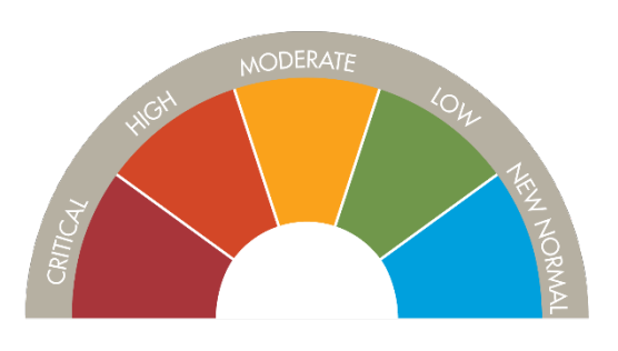
Figure 5. KEY

The maps below show hypothetical examples of how the public health guidance colors could be applied.